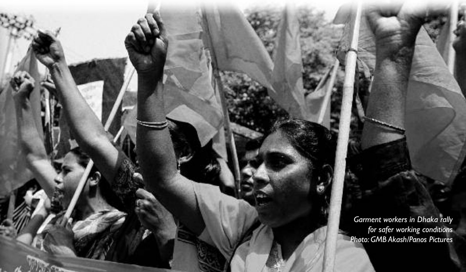
Garment workers in Dhaka rally for safer working conditions

Tesco, Asda and Primark all respect the rights of their UK workers to join and form trade unions. Yet they deprive overseas workers supplying their stores of this same essential right, even though it is protected under the terms of the Ethical Trading Initiative. In the final analysis, it is easier for factory owners to exploit a non-unionised workforce: workers who negotiate independently for better wages and decent hours lack the necessary leverage which trade unions provide.