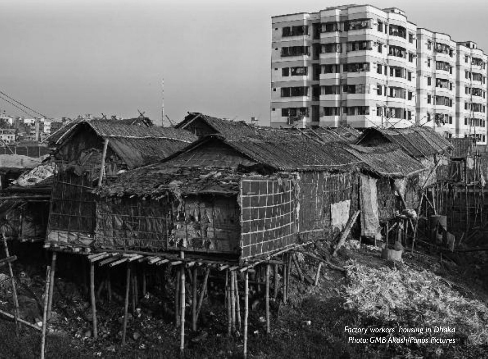
Factory workers' housing in Dhaka

Tesco have clear plans in place to start paying a living wage, despite this being a condition of their membership of the Ethical Trading Initiative. Primark has made no commitment to paying a living wage to workers in its supply chains, while Tesco and Asda claim that by linking pay to productivity, the wages of workers will rise to acceptable levels. As part of such targets-based pay schemes, however, garment workers will have to produce even more clothing under the same deadlines. Even if they meet their targets, there is no guarantee that factory managers will pass on the financial gains to workers. 5