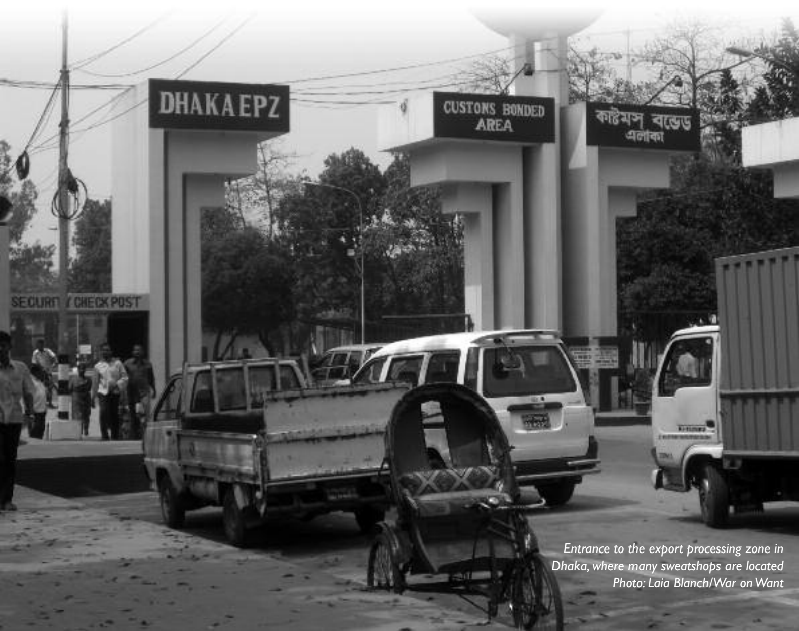
Entrance to the export processing zone in Dhaka, where many sweatshops are located

The absence of benefits has a significant impact on workers who fall ill and need to miss work. As Sultana, a worker in a factory supplying Asda, explained to us: “I was sick for nine days and couldn’t work, and my nine days’ wages have been deducted.” Failure to provide such basic social protections contravenes the central tenets of ‘decent work’ (see box) and condemns many workers to desperate and long-term poverty.