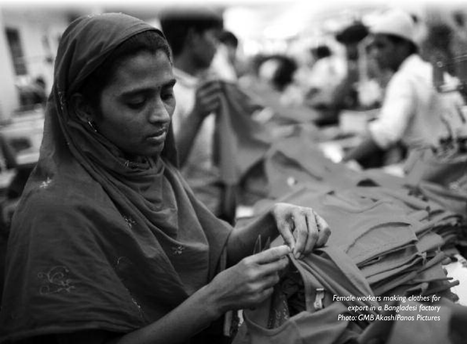
Female workers making clothes for export in a Bangladeshi factory

Clothing retailers have for many years imposed unrealistic deadlines that fail to take into account the capacity of suppliers, and the advent of 'fast fashion' has only accelerated this trend. Many factory managers use the unreasonable targets set by retailers as justification for the abuse of workers. The working conditions which result put even more pressure on garment workers, the vast majority of whom have no other employment options available to them.